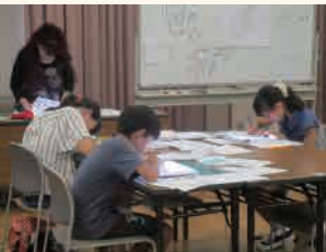
Hiroshima Animation Workshop 2017