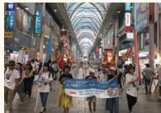
Parade in Hondori Street

For making the city lively and promoting local activation, "100 Days Before the Festival" at the Old Bank of Japan - Hiroshima Branch, and a parade in Hondori Street in Hiroshima City will be held.