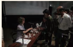
Seminar from HIROSHIMA 2018

Also, throughout the year, the festival offers various educational projects, including animation workshops for students of the 5th to 9th grade, Flip Book Contest, workshops of animation production for art teachers, conducting special lectures at junior high school and high school, and supporting animation production for art clubs of junior high school. In addition, for diffusing animation, related projects are held for the local people, for example, screenings of award winning works at the art museums, etc., in Hiroshima within the celebration of International Animation Day (October 28th).