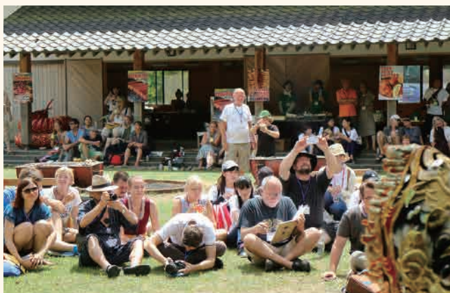
Picnic at Hikimikyo

The festival also attempts to enhance hospitality and to attract audience members. The festival team with volunteers introduce various Japanese culture to festival guests from abroad, including local attractions with world heritage sites and industries from Hiroshima.