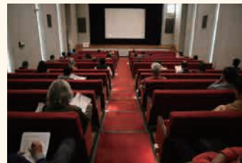
International Animation Day 2018